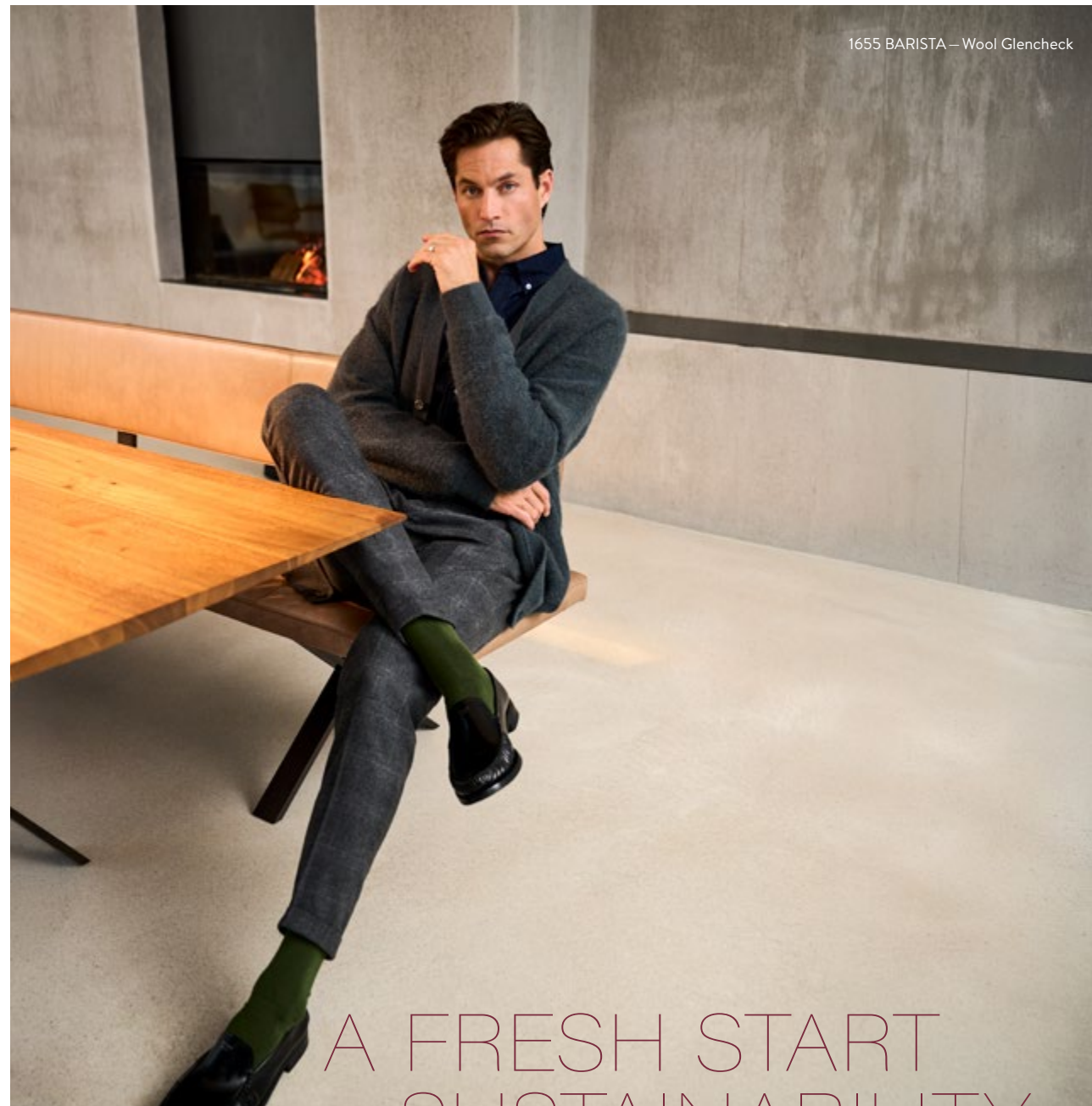
1655 BARISTA – Wool Glencheck