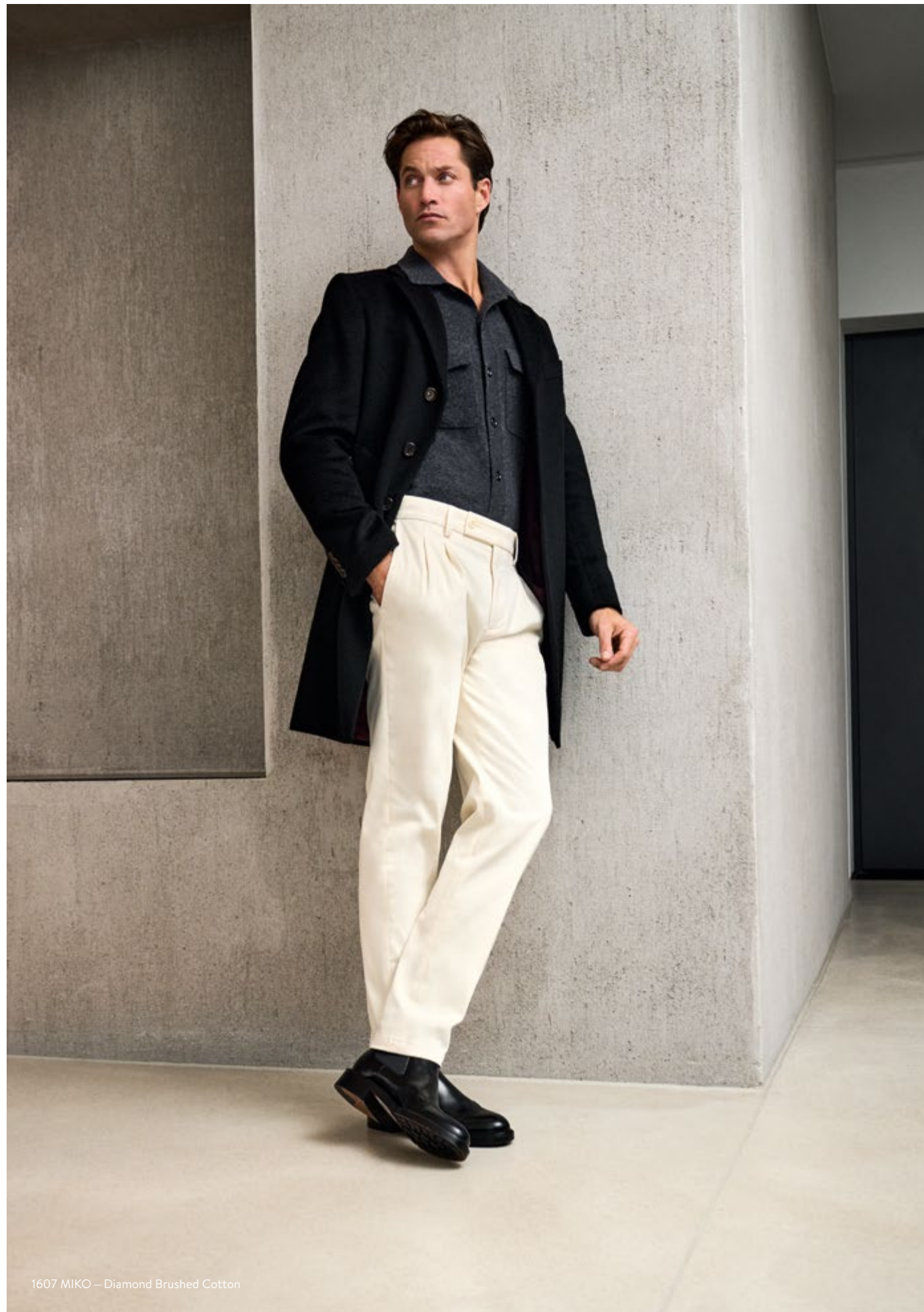
1607 MIKO – Diamond Brushed Cotton