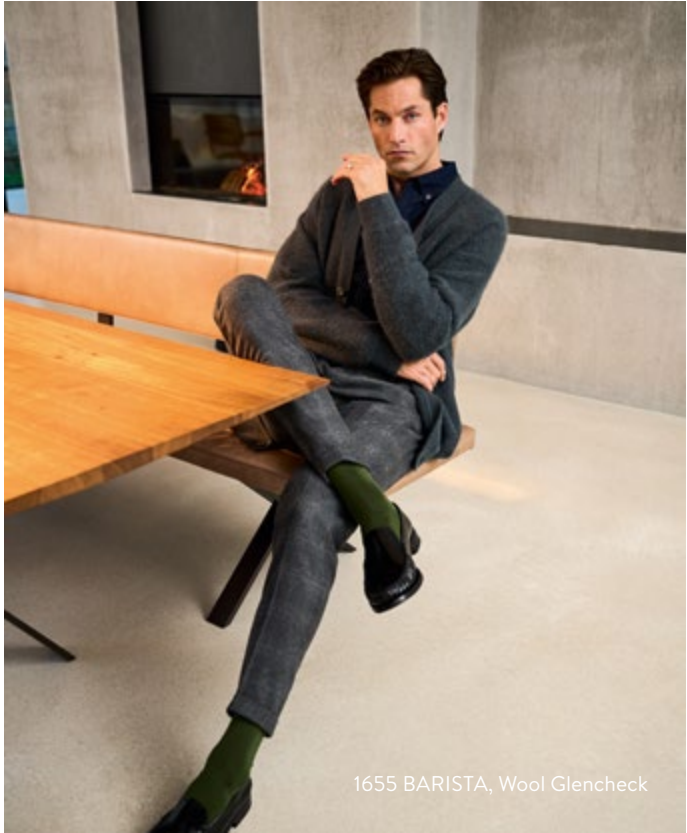
1655 BARISTA, Wool Glencheck