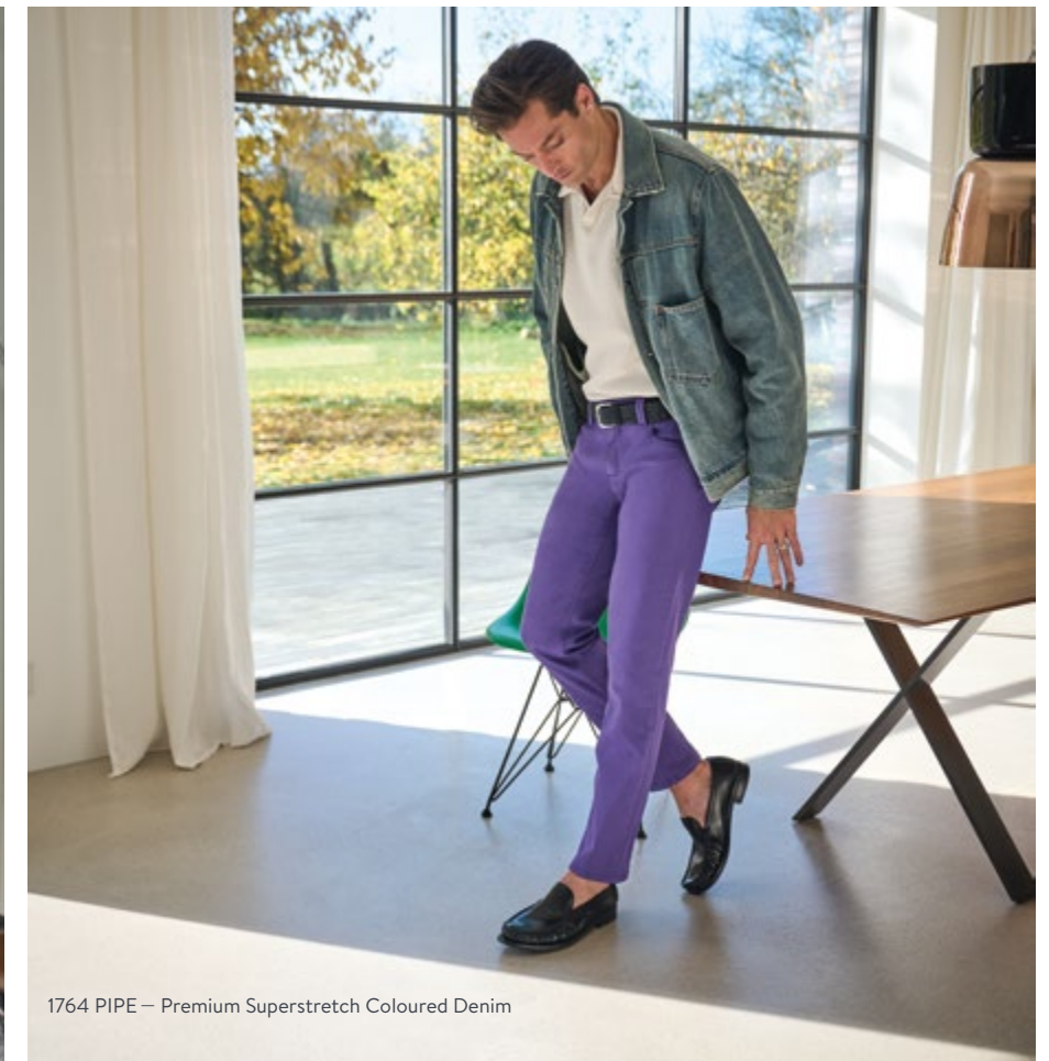
1764 PIPE – Premium Superstretch Coloured Denim