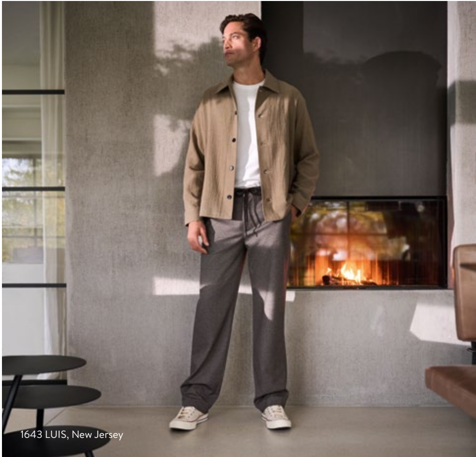
1643 LUIS, New Jersey

Autumn/winter 2026 doesn't start with a change in weather. It starts with an attitude. With a desire for movement, for smart fabrics, for elegance, and for a one-of-a-kind wearing experience. ALBERTO offers pants that think. Fabrics that breathe. Shapes that feel like progress. Fit, cut, and fabric – at ALBERTO, we know that these three factors are everything when it comes to the perfect pants for wintry weather. The Mönchengladbach-based pants experts have combined elegant design with smart functionality ever since the early days, relying on premium fabrics that are woven in European mills and designed to stand up well to everyday wear and tear. Once again, the 2026 autumn/winter season showcases models that not only look exceptional and fit flawlessly but also cut a fine figure in high winds and stormy weather.