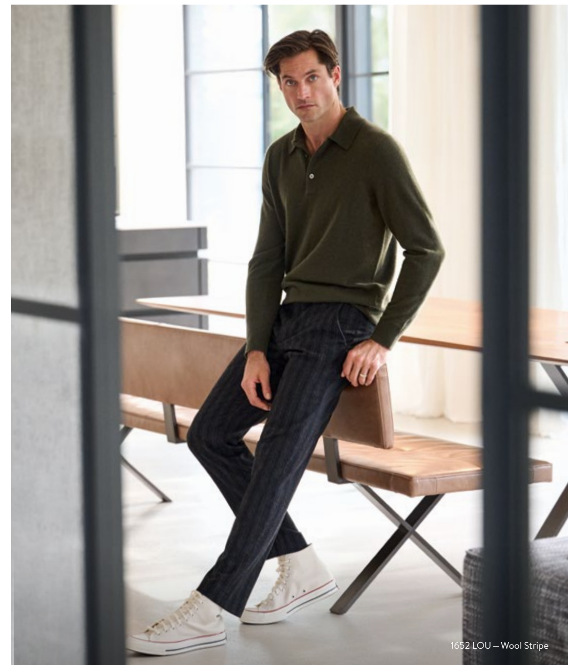
1652 LOU – Wool Stripe

The transition from the old year to the new is traditionally a time to pause, reflect, and take a bold look ahead to the future. Questions about continuity and change come to the fore: what will move on, what will stay the same? ALBERTO and its production partners have spent years exploring this very question, driving the consistent, forward-thinking development of a fashion culture defined by sustainability and quality without sacrificing an iota of style. This approach once again played a defining role in the design of the autumn/winter 2026 pants collection.