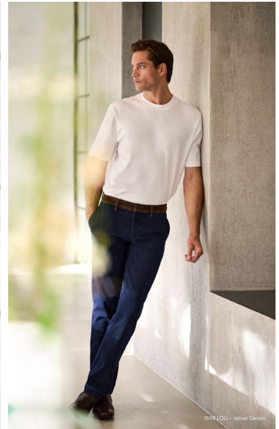
1698 LOU – Velvet Denim