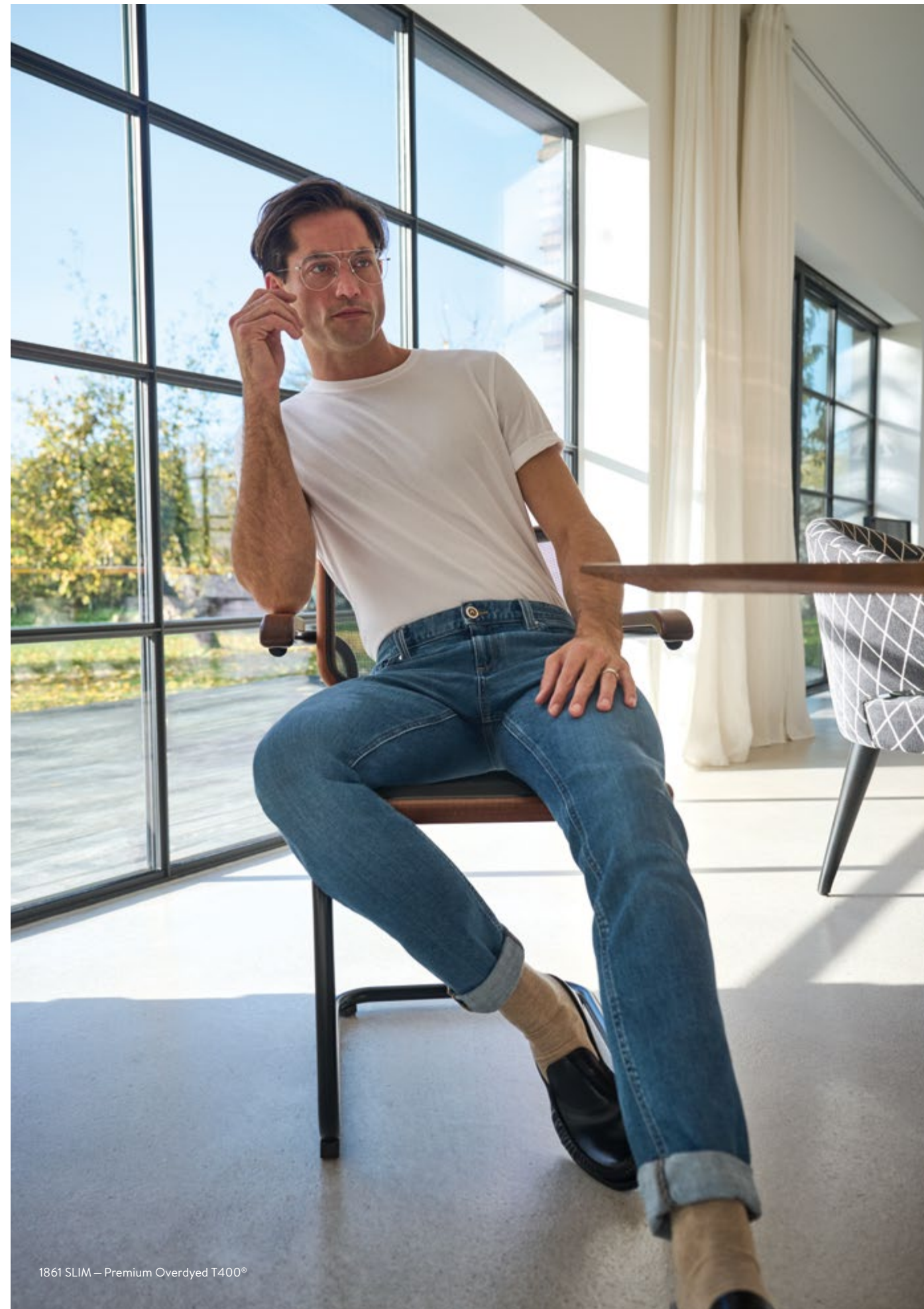
1861 SLIM – Premium Overdyed T400®