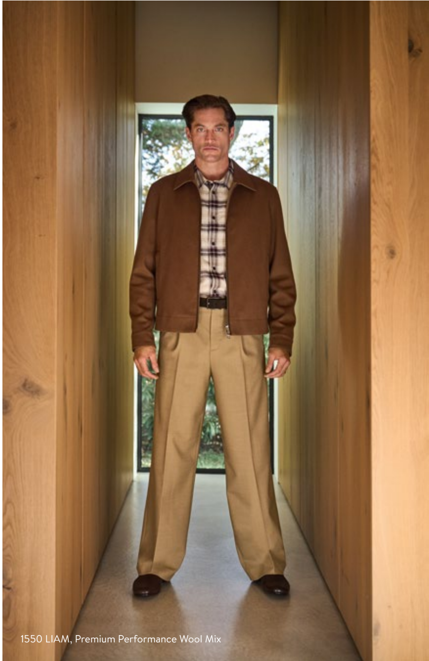
1550 LIAM, Premium Performance Wool Mix