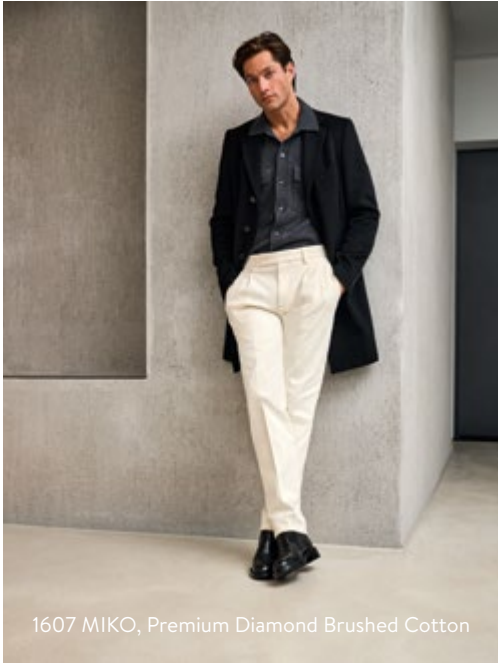
1607 MIKO, Premium Diamond Brushed Cotton